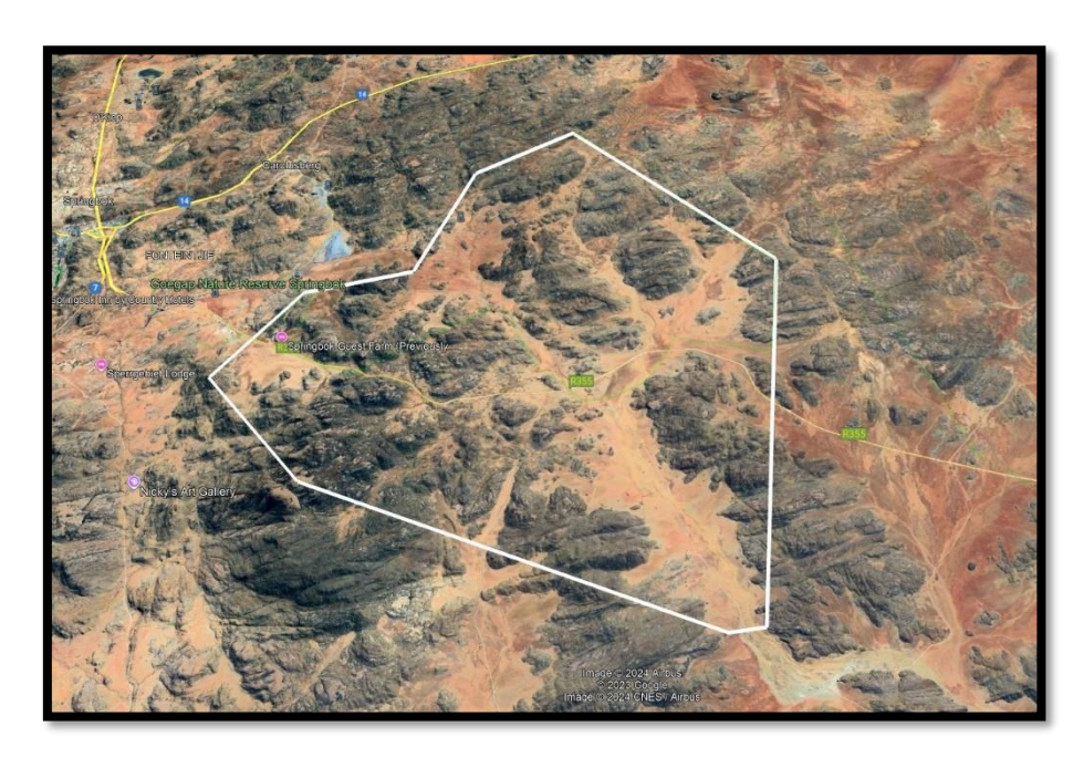
Figure 1: Satellite view showing the position of Site Alternative 1 (white polygon) within the surrounding landscape. no alternative was identified for this site .