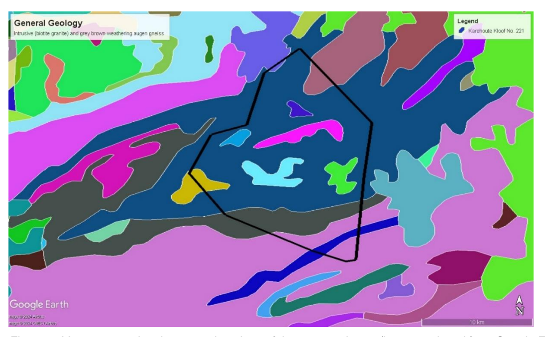
Figure 3: Map representing the general geology of the proposed area

stage smaller intrusions of U-rich leucogranite that may constitute potential resources of uranium.