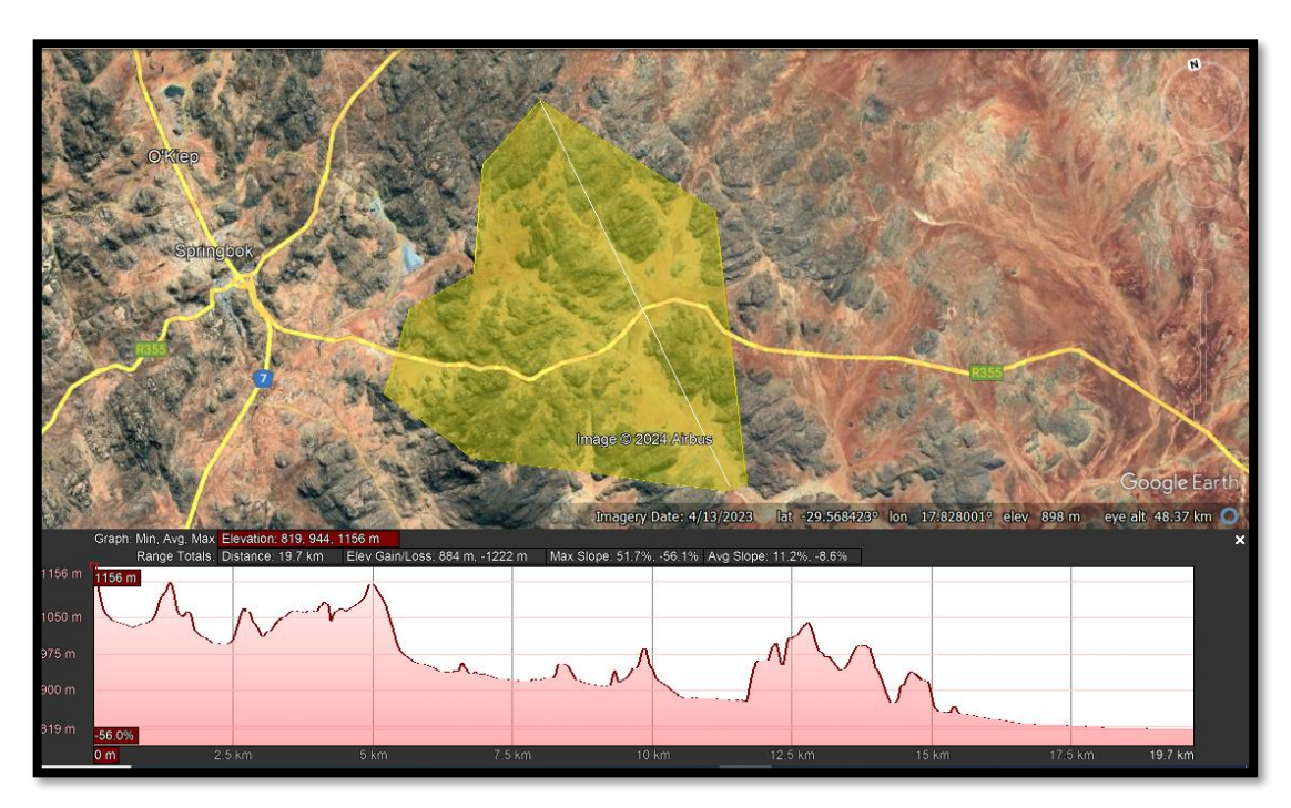
Figure 2: Map showing the Elevation profile of the proposed prospecting footprint (Image obtained from Google Earth).

channels of intermittent water courses. The elevation loss from the north corner to the south corner of the proposed footprint is 1222 m over 19.3 km.